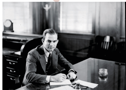
J. WILLIAM FULBRIGHT UNITED STATES SENATOR 1945–74

Creative leadership and liberal education, which in fact go together, are the first requirements for a hopeful future for humankind. Fostering these—leadership, learning, and empathy between cultures—was and remains the purpose of the international scholarship program I was privileged to sponsor in the US Senate.”