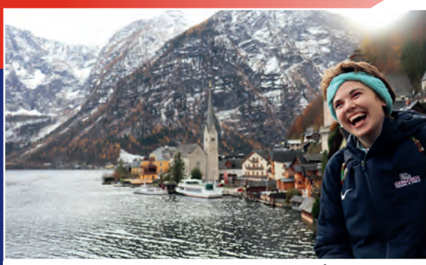
Greetings from Hallstatt